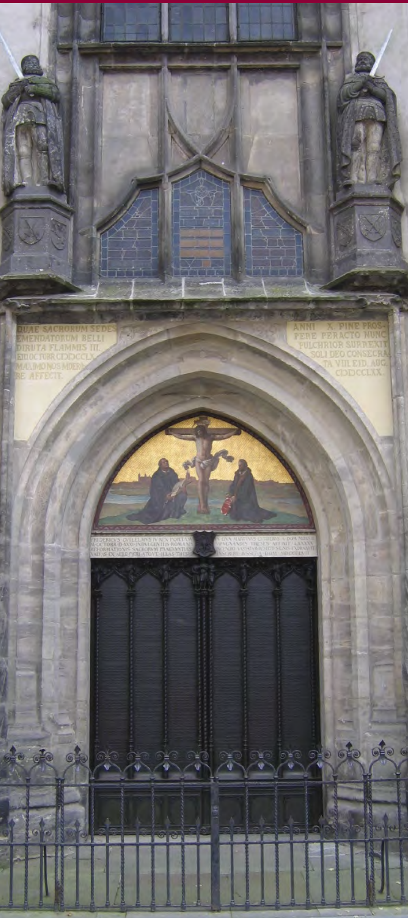
The Wittenberg doors where, according to tradition, Luther posted his 95 Theses in 1517.